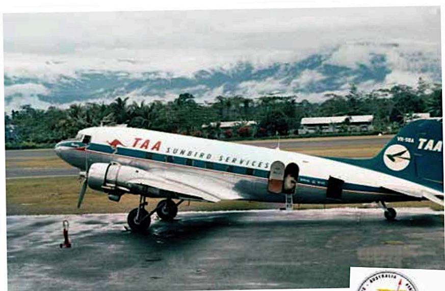
Registered VH-SBA, for TAA Sunbird Services - 'Hawdon' in the standard livery at Lae Airport, PNG, date unknown