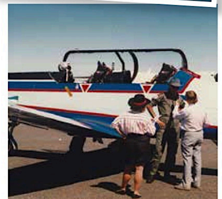
Chief of Airstaff, Ray Funnell, with the PC9 being interviewed by the press

coast, then back east via Kalgoorlie, Forrest, Ceduna, Adelaide, Hamilton. It was run VFR on a handicapping system, and, as it turned out, only the last leg - from Melbourne to Canberra - was cancelled due to weather.