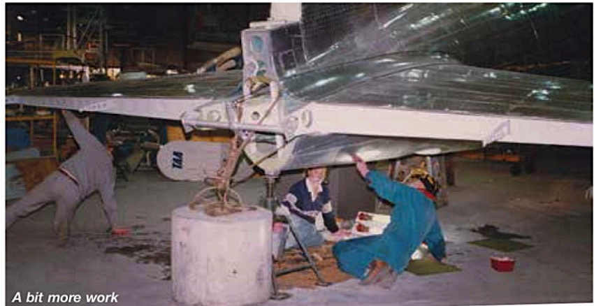
A bit more work

By January 1988, VH-AES was brought down from her perch and positioned in the Qantas maintenance hangar, a massive and impressive structure. Here, she was in good hands. Hawdon Enterprises engaged a number of the best engineers in the business for the