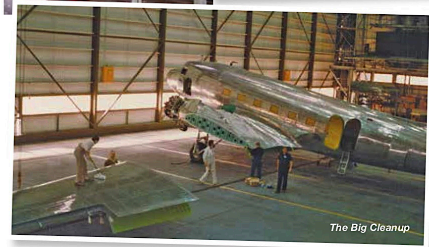
The Big Cleanup