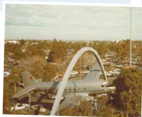
VH-AES on static display, Tullamarine Airport, Melbourne

In 1946, now based at Essendon and, at times, operating out of Laverton, Hawdon flew TAA's inaugural Melbourne-Sydney-Melbourne passenger route. Onboard were 21 passengers, with a crew of two pilots and an 'air hostess'. I have read that, after WW2, quite a number of nurses were recruited for this role. They certainly preferred you to have a nursing background.