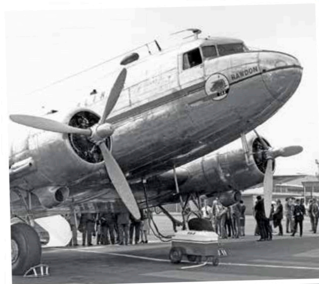
Melbourne Laverton Airport, September 09, 1971. This was the first re-enactment of the airline's inaugural flight, between stints in PNG.