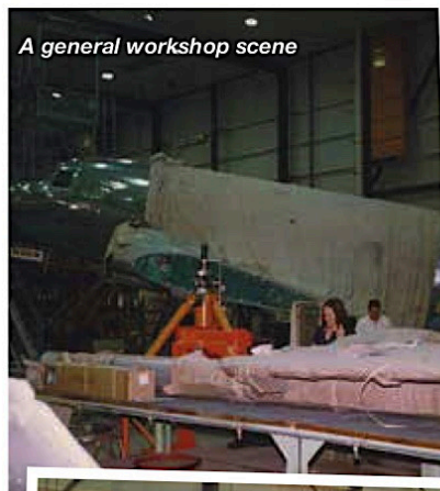
A general workshop scene