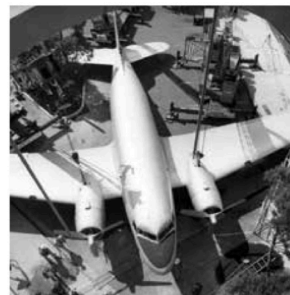
'Hawdon' being prepared to be lifted into place for display outside the TAA Passenger Terminal. Dec 1979