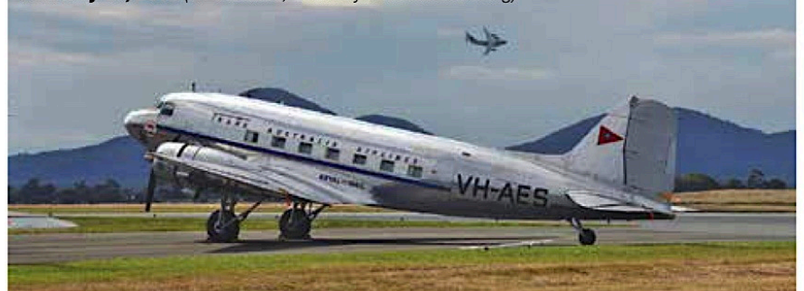
Trans Australia Airlines - 'Hawdon' in the original livery at Melbourne Avalon Airport, February 27, 2013

coast, then back east via Kalgoorlie, Forrest, Ceduna, Adelaide, Hamilton. It was run VFR on a handicapping system, and, as it turned out, only the last leg - from Melbourne to Canberra - was cancelled due to weather.